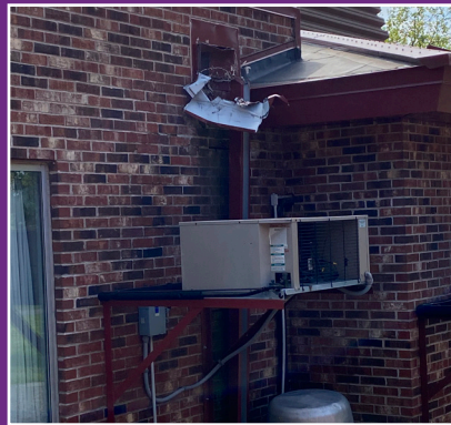
Infrastructure and Building Systems