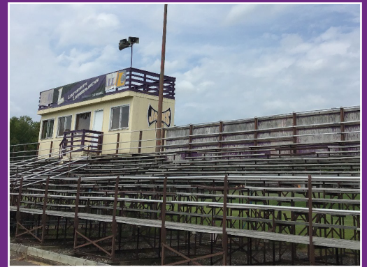
Safety and Security