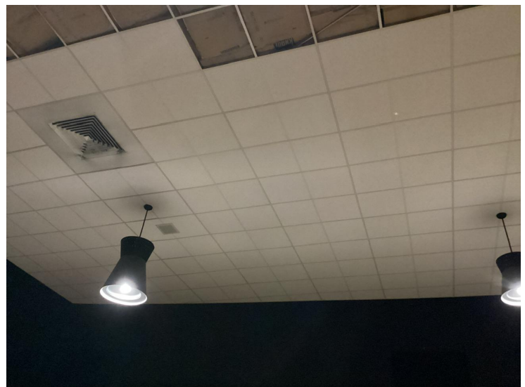
Ceiling being replaced in Auditorium