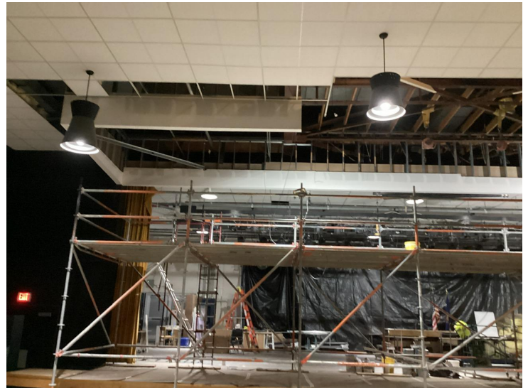
Soffit above stage in Auditorium framed and drywalled