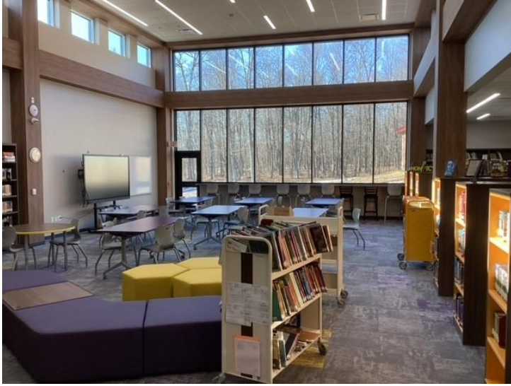
Completed construction in Media Center addition