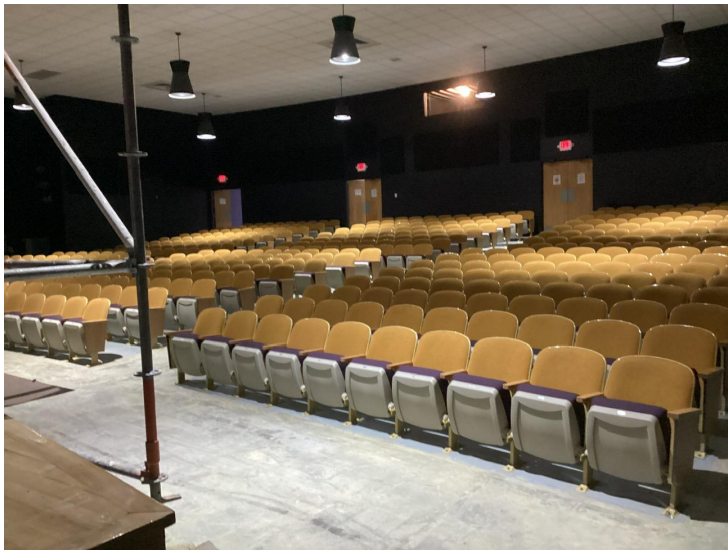
Replaced Auditorium seat bottoms