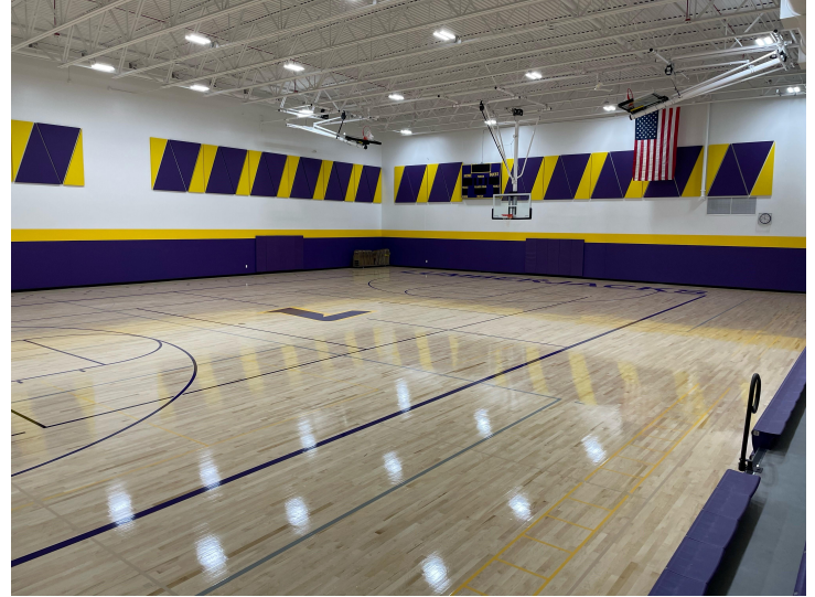
Completed Gym Addition