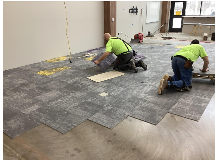
Laying carpet tile in media center addition