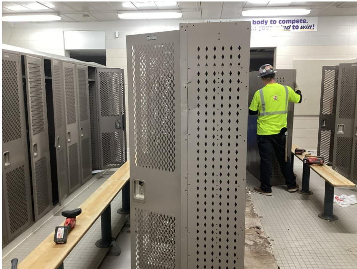
Replacing existing lockers and benches