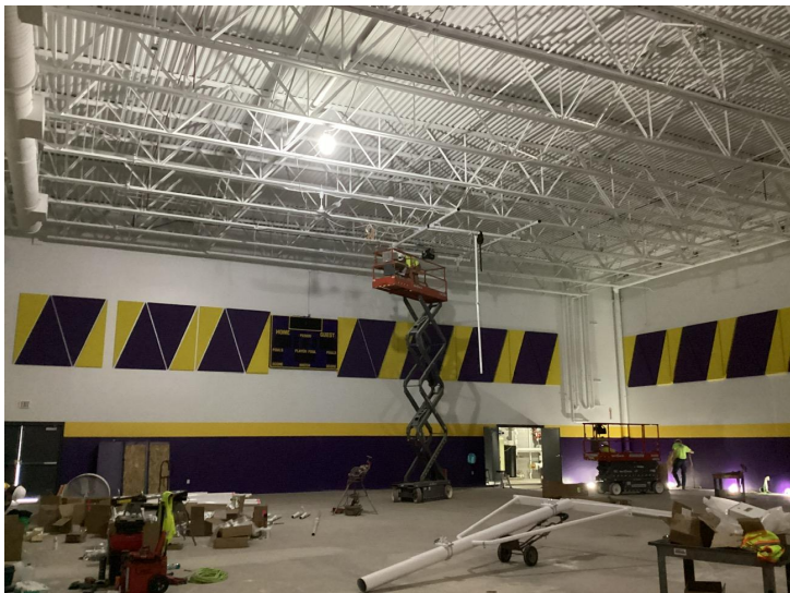
Electrical and Gym Equipment activities in gym addition