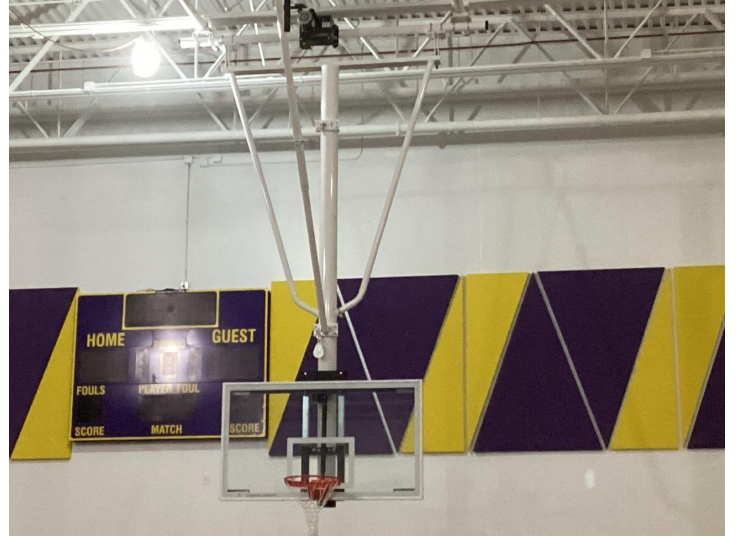
Gym equipment hung in gym addition