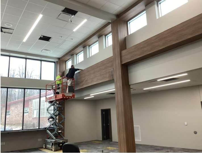
Wrapping columns with vinyl teak