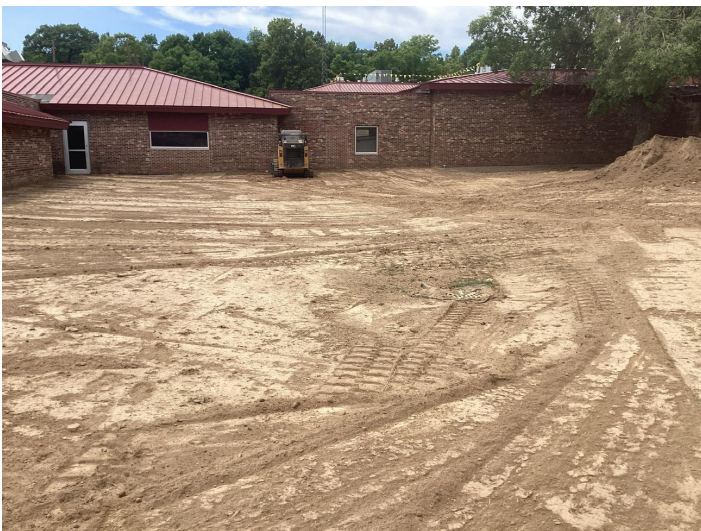
Grading Before Seeding in Large Courtyard