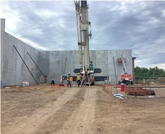
Erecting Precast Concrete Panels for the New Gym