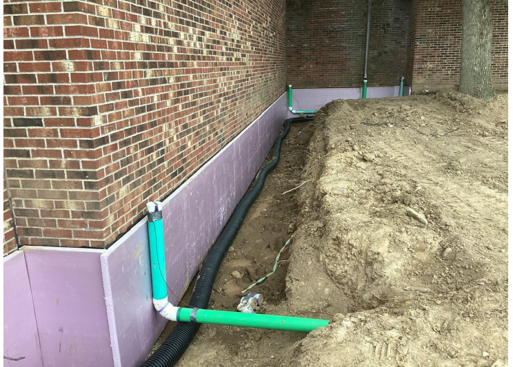
Drain Tile and Storm Water Pipe Leads for Roof Water Runoff