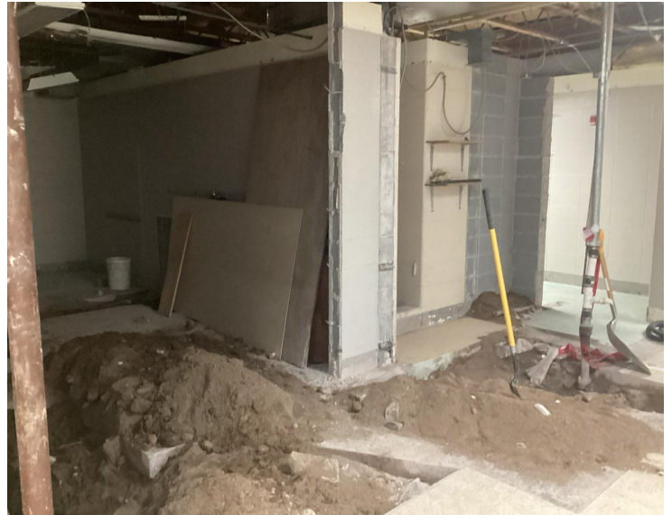
Demolition of Restrooms at Cafeteria