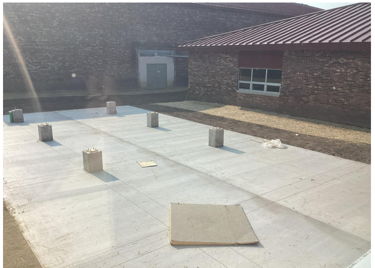
Finished Slab for Timber Canopy in Courtyard