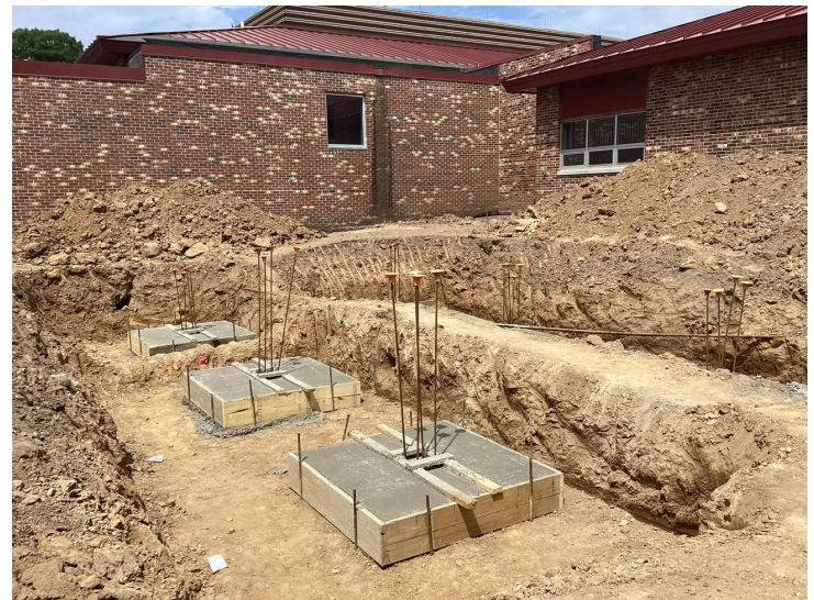
Foundation for Timber Canopy in Courtyard