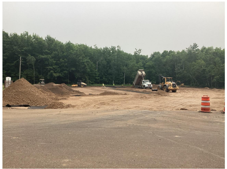
Installing Base Course for New Asphalt Parking Lot