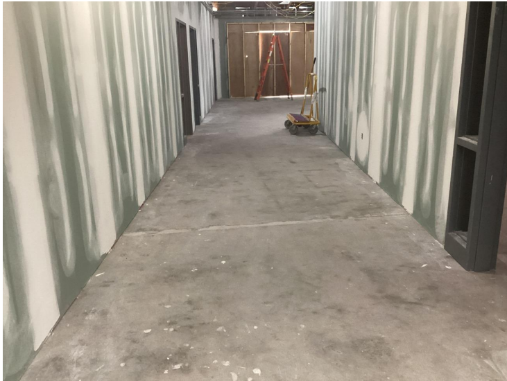
Drywall and Door Frames in Previous Library Area