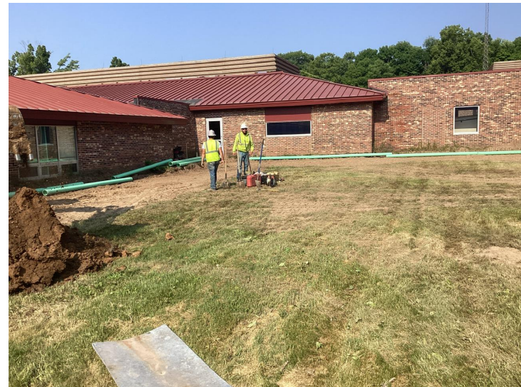
Drain Tile Installation