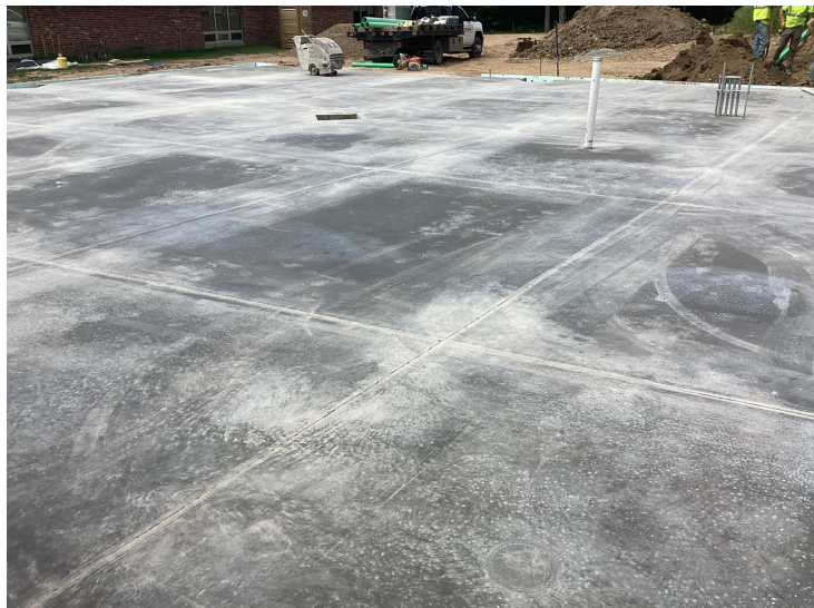
Slab at Media Center Poured and Joints Cut