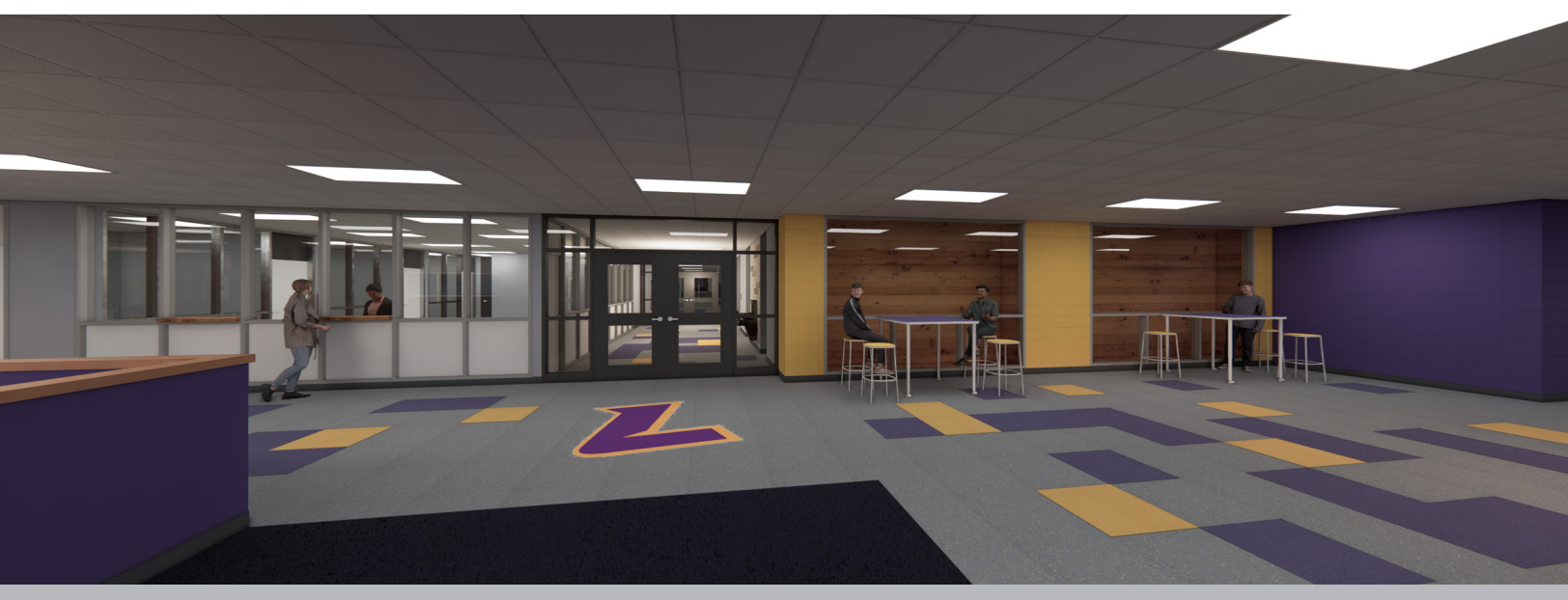
RENDERING OF NEW ENTRY