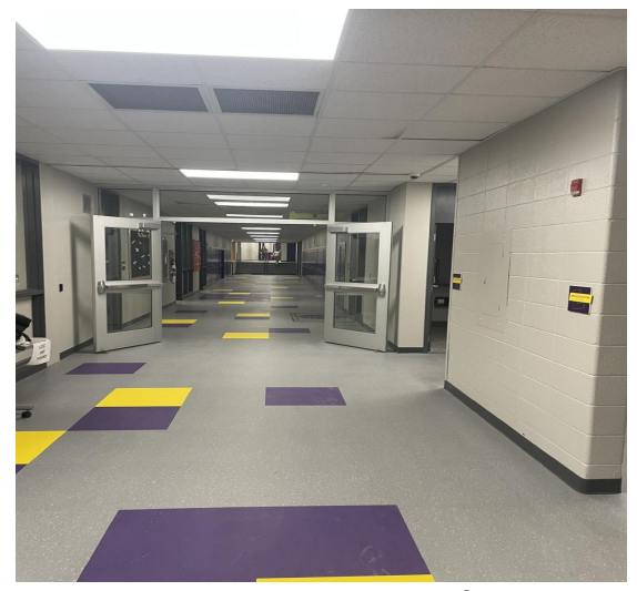
Installed Magnetic Hold-opens on Security Doors