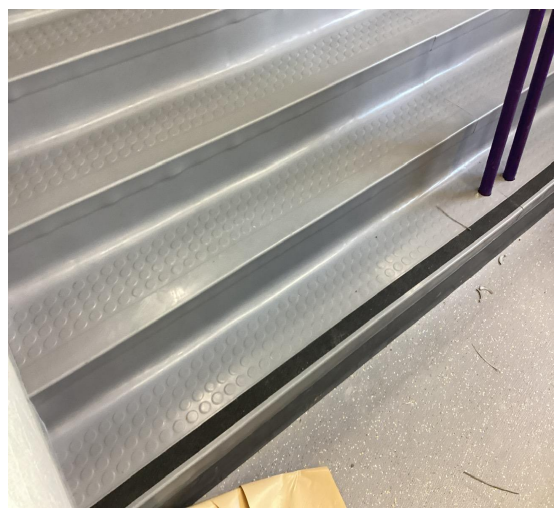
Stair Tread Flooring Finishes Installed