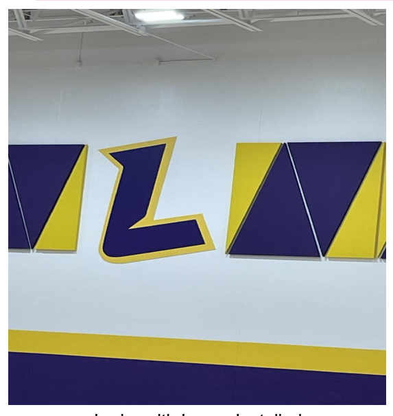
Ladysmith Logos Installed