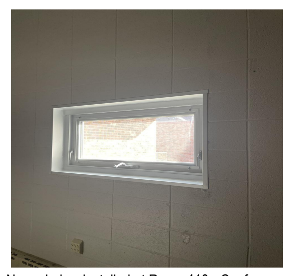
New window installed at Room 410 - Conference