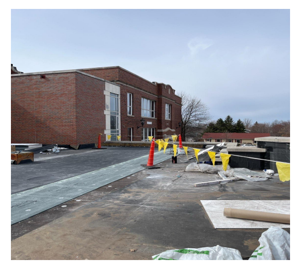
Roofing Work at Ladysmith Elementary