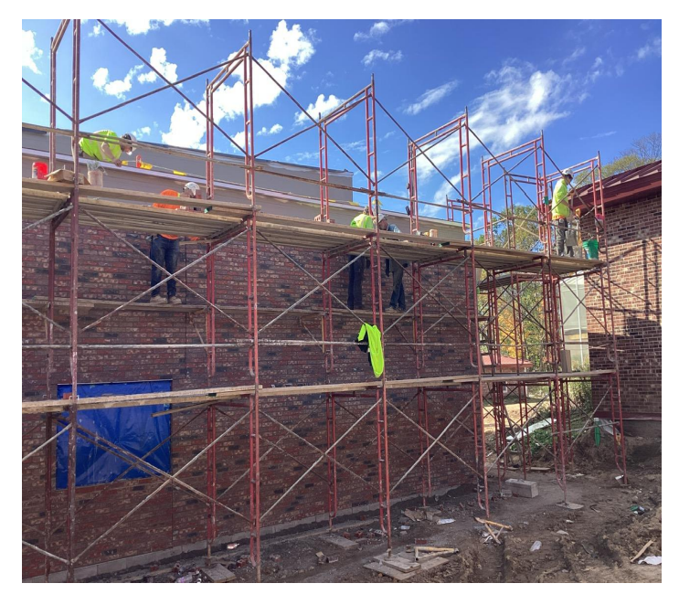
Brick veneer being installed at Media Center addition