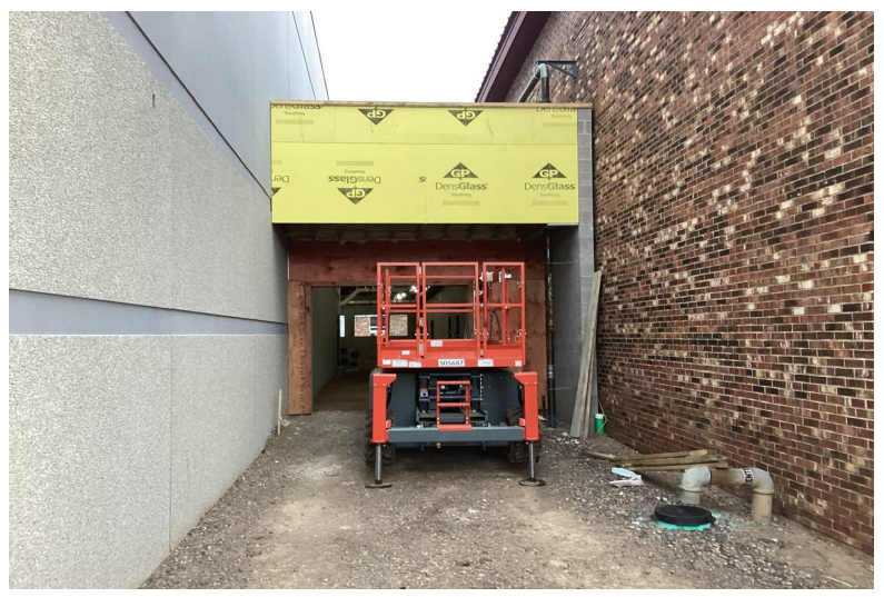
Entrance to gym addition corridor installed