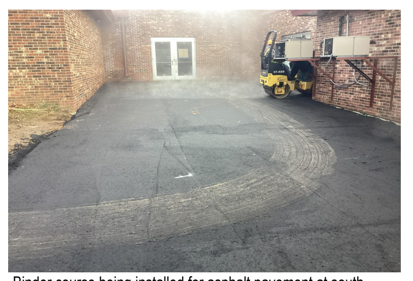
Binder course being installed for asphalt pavement at south parking lot/drive lanes