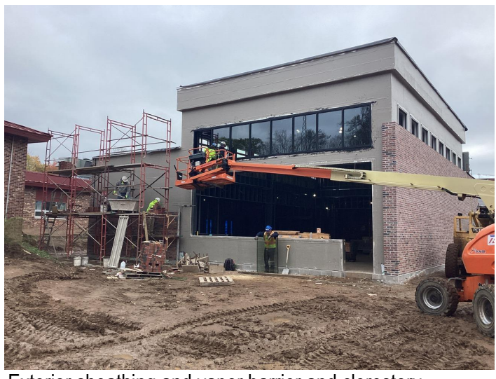
Exterior sheathing and vapor barrier and clerestory windows complete at Media Center