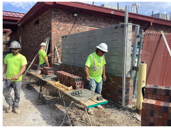
Trash enclosure wall replaced