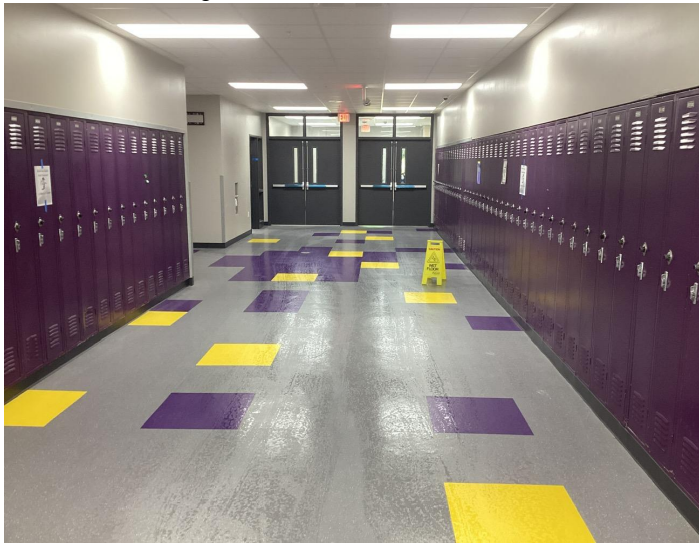
New Floors and Vestibule Doorways