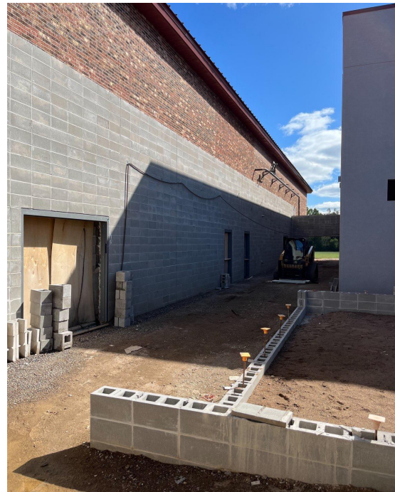
Block Walls and Foundations for Gym Corridor/Storage