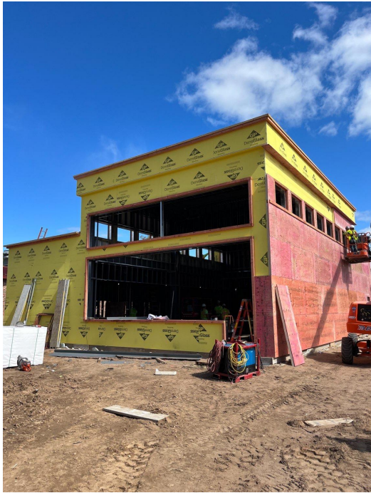
Sheathing Exterior Walls of Media Center