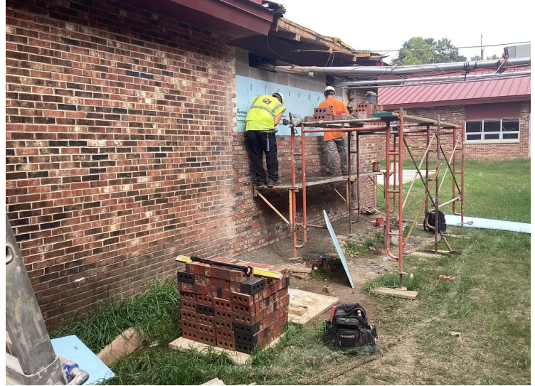
Installing Brick Veneer at Previous Gym/Cafeteria Connection