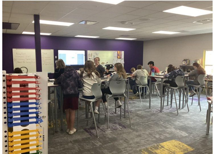
Renovated Classroom Space